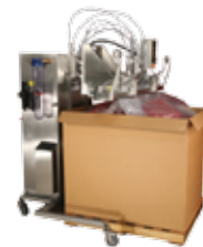
Bulk Bin Rollaround