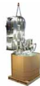
Bulk Bin Suspended